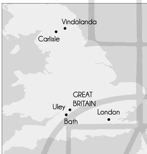
Figure 1: Areal distribution of the main corpora from Roman Britain

Conversely, the Vindolanda corpus is still unparalleled in its range, vivacity of text types, and number of tablets; the Carlisle corpus, despite its meagre size, is a good source of comparison to the Vindolanda corpus because they are both composed of documents written in auxiliary forts alongside the Stanegate road 15 (see Figure 2). On a different note, the corpus of curse tablets represents a different type of non-literary documents because they belong to a later period (see Table 1), but more importantly because they appear as the product of the local population which merged its indigenous features with those of the Latin culture. Each corpus shows specific features which deserve a thorough analysis through specific case studies that will be the subjects of the following chapters. However, each corpus needs a few more words for a proper contextualization and to show their dimension, the text types available, and who the writers were, at least on a general level.